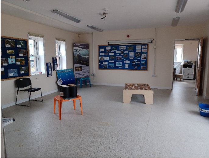
c. The Old Coastguard Station 6.25 x 6.60 m